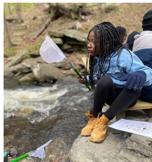
A student considers her catch in Blair Creek.