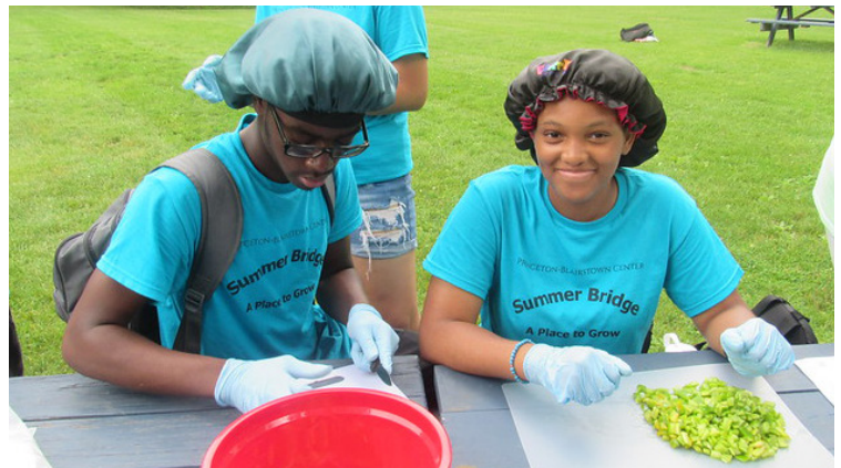
Summer Bridge students prepare HelloFresh ingredients together.

partnership in action. Witnessing the students’ enthusiasm for culinary activities and their enjoyment in the cooking process inspired a fresh perspective on customer centricity for HelloFresh. The interaction between the students and the HelloFresh team left an indelible impact not only on the HelloFresh staff, but also on PBC’s Summer Bridge participants.