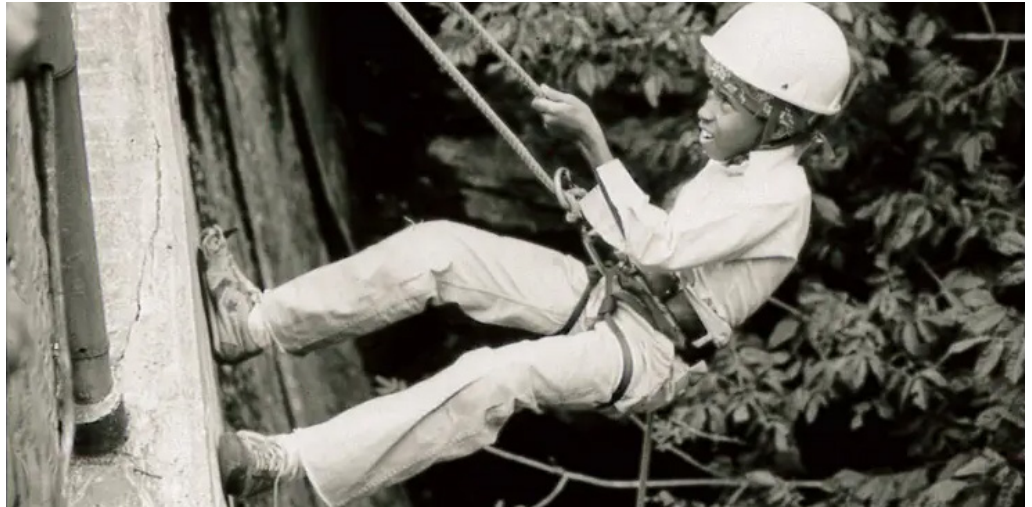
Many iconic PBC activities have endured through the decades, such as the Dam Rappel. Here, a participant rappels down the Bass Lake dam in 1984.