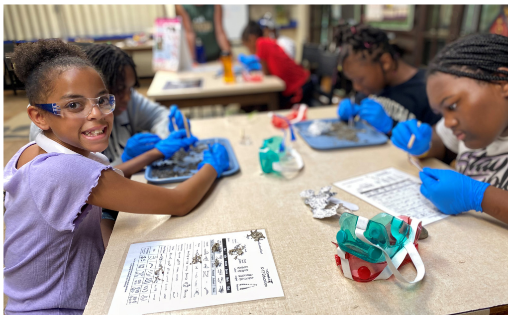
Students work together to reassemble skeletons from their dissected owl pellets during Venture Out.

The following morning, Nikki and her classmates checked the PBC weather station and learned how to use data from the instruments in the weather station to predict the weather. From there, they walked to Blair Creek where they conducted a stream study, checking for the presence or absence